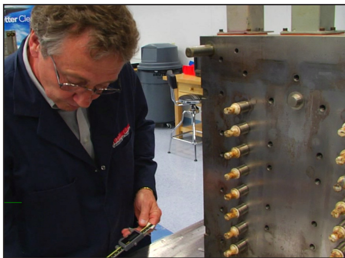
Cleaning, repairing and inspecting molds.

restore the mold to production readiness. This work must either be done in-house (more burden for the receiving shop) or farmed out to the "local" mold shop, causing more delays and incurring more costs for having the mold serviced.