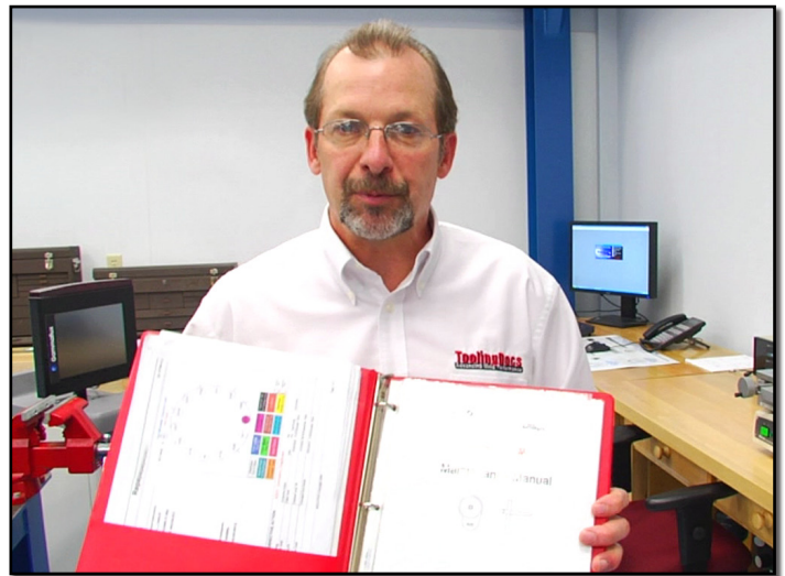
A comprehensive "Mold Book" to re-start the documentation process for your mold.

Too often a mold will arrive at its final destination unable to run due to improper preparation, protection or packaging for shipment. These surprises can cause delays for start-up, and will require time and sometimes a lot of money to