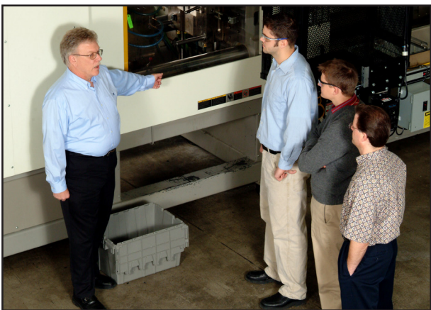
In-house assessment and training services.

ToolingDocs can work with customers via Webex or teleconferencing to help coordinate and manage the tool transfer process.