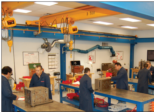
Learn proper shop design and layout features along with benefits and systems costs.