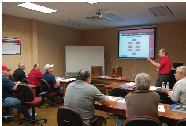
Maintenance managers will learn to lead their teams using the latest, most effective systems and processes.